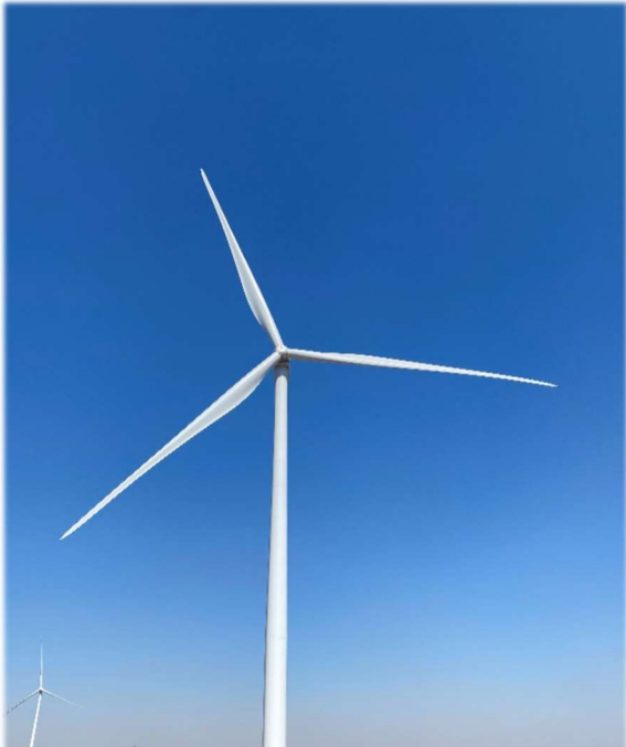
One of the 72 wind turbines at the Sundance wind farm, which began commercial operation in April 2021.